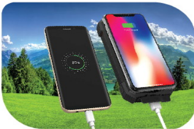
Wired and wireless charging at the same time