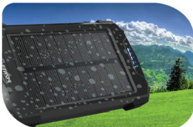
Water resistant IPX4