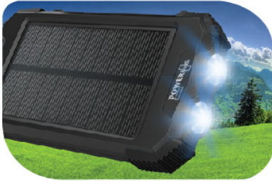
1.2W solar cell • 2 LED powerful flashlight

The Beluga combines heavy duty performance with an elegant design and is a perfect solution for today's needs for mobile equipment. Easily charges mobile phone and tablets and other mobile USB rechargeable equipment. Your perfect travel companion !