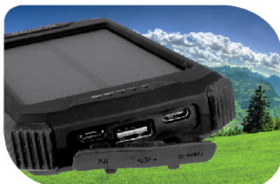
Micro USB input 2.1A - USB output 2.1A Type C input/output 2.1A